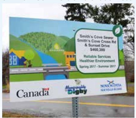
Project Signage in Smith's Cove

Work has just finished on the installation of sewer lines on Sunset Drive and Smith's Cove Cross Road. The $578,601.13 project was awarded to DJ Lowe and the work was done over the summer and throughout the fall. Both systems are gravity based, which means no pumping stations were required. The Sunset Drive project included 483 metres of sewer line and Smith's Cove Cross Road had 270 metres. This work will allow homeowners and a business