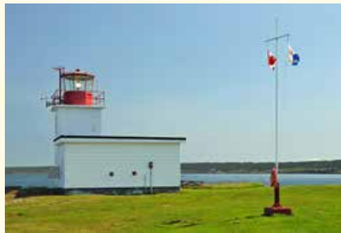
Grand Passage(Northern) Lighthouse Constructed 1965 34 foot tower white with red lantern Replaced 1901 Tower