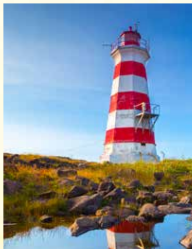
Western(Brier Island) Lighthouse Constructed 1944 Octagonal concrete 60 foot tower Three red identification bands Replaced 1832 Tower