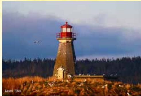
Peters Island Lighthouse Constructed 1909 Octagonal Wooden 44 Foot Tower White with Red Lantern Replaced 1883 Tower