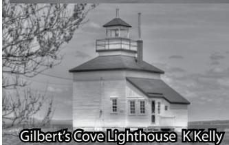
Gilbert's Cove Lighthouse K Kelly