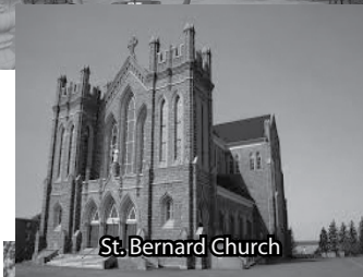
St. Bernard Church