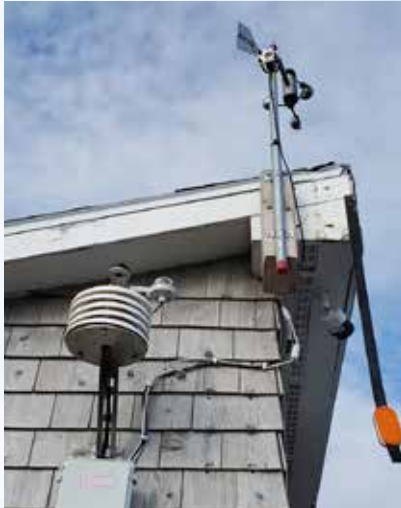
Tidal weather station located at the Digby Wharf