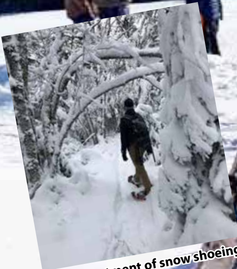
The enchantment of snow shoeing