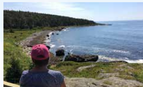
Laurence and Diane Outhouse leased 10 acres of land at Bear Cove on Long Island for use as a municipal park.

Community members have held an annual beach clean up and BBQ there since 2018 and in 2019 the first local folk art was placed along the trail.