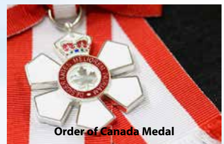
Order of Canada Medal

The motto of the Order, DESID-ERANTES MELIOREM PATRIAM (They desire a better country).