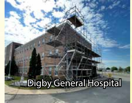
Digby General Hospital

Digby General Hospital patients, visitors, urged to use caution while work underway.