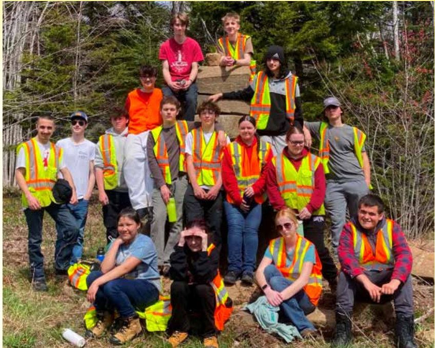
Digby Regional High School O2 Class Members

They also partnered with Scotian Shores and the Sandy Cove Conservancy for a shoreline cleanup in Sandy Cove, where volunteers collected 585 lbs of garbage and marine debris — including 4,000 lobster bands, rope, plastic, and other waste. An impressive 66% of the material collected was diverted from landfill for recycling.