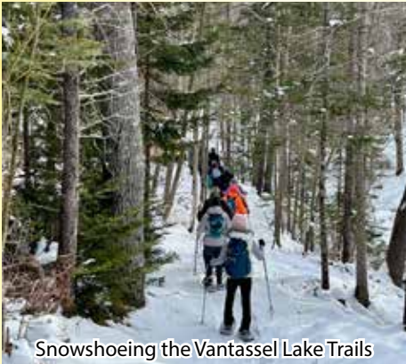
Snowshoeing the Vantassel Lake Trails