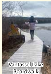
Vantassel Lake Boardwalk

Get your Coastline by email Send request to: heritage@digbymun.ca