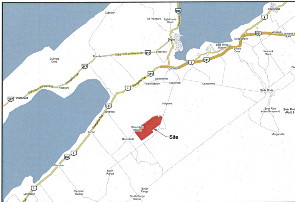
Figure 1. Plan Area Location

The Plan Area is a 228.2 hectare (563.9 acre) site located in the community of Hillgrove, approximately seven kilometres southwest of the Town of Digby. The airport is at an elevation of 150 metres making it the highest airport in Nova Scotia. The existing site is accessed via Bloomfield Road.