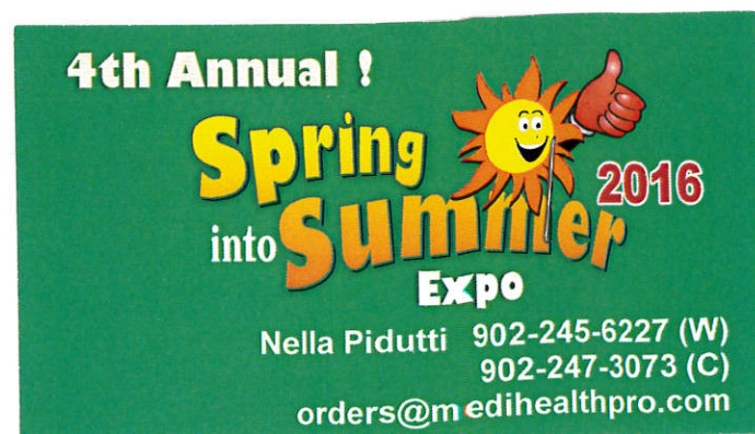
The Spring into Summer Trade Show Committee