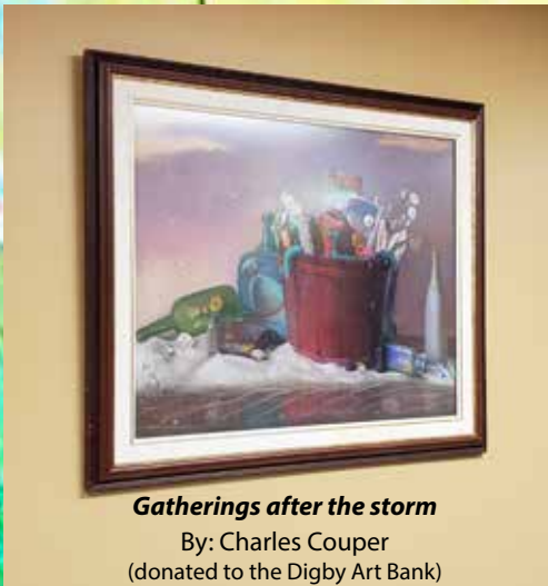
Gatherings after the storm