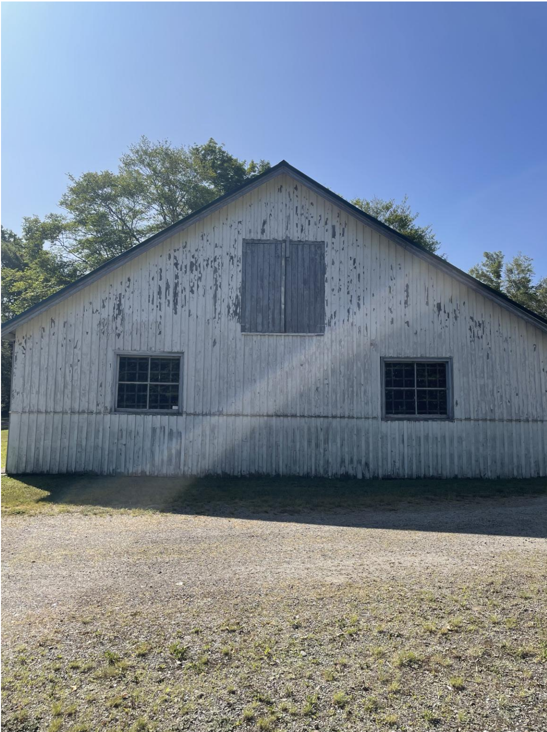
Northwest side of building