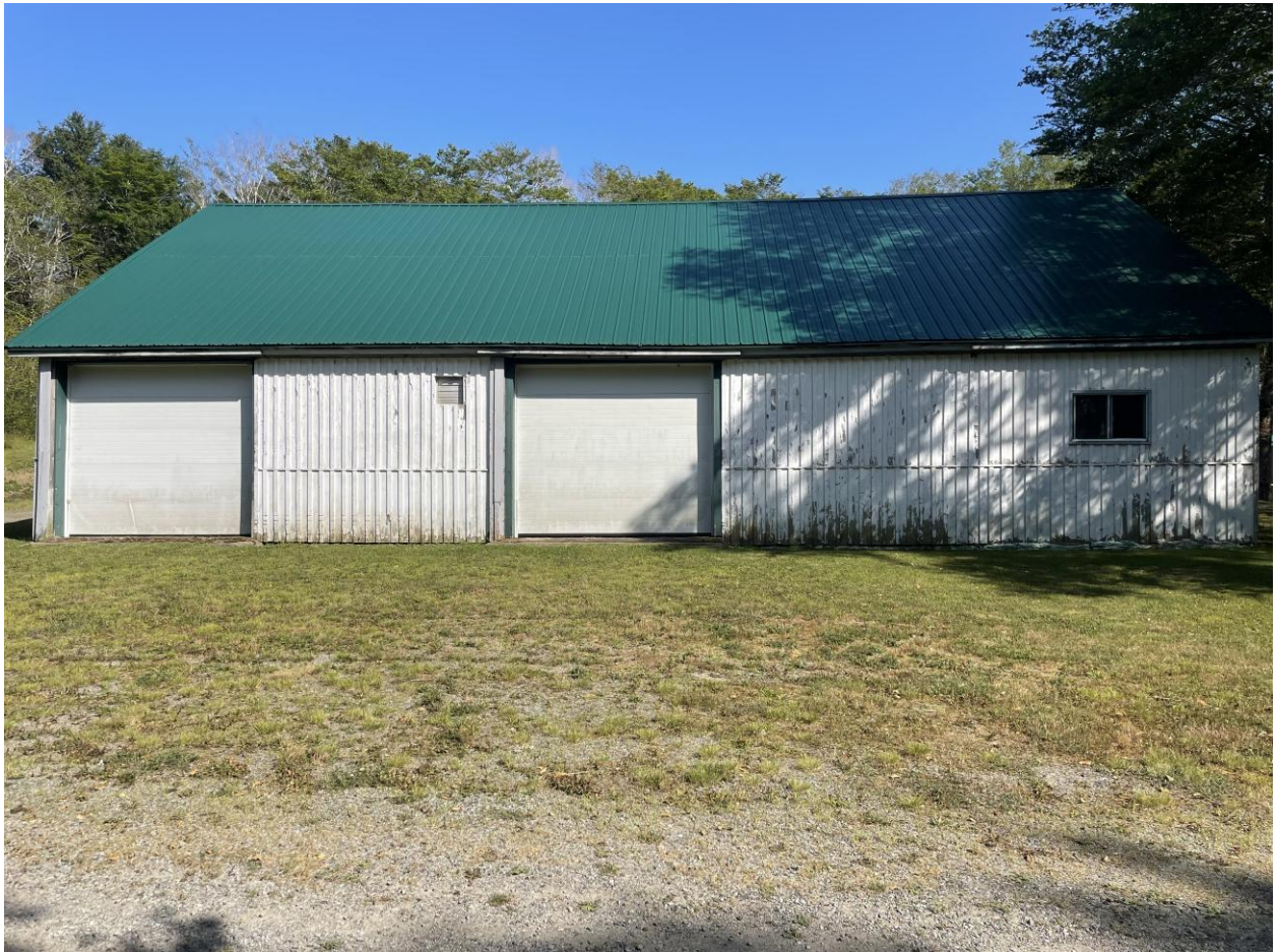
Northeast side of building