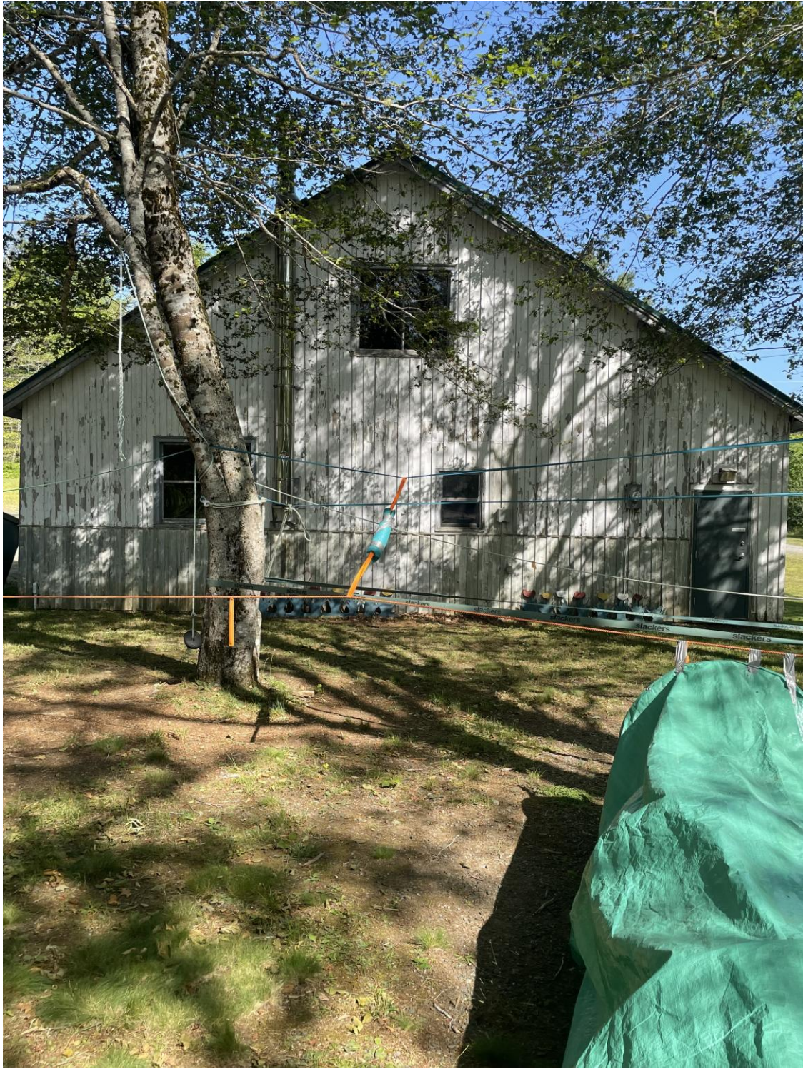
Southeast side of building