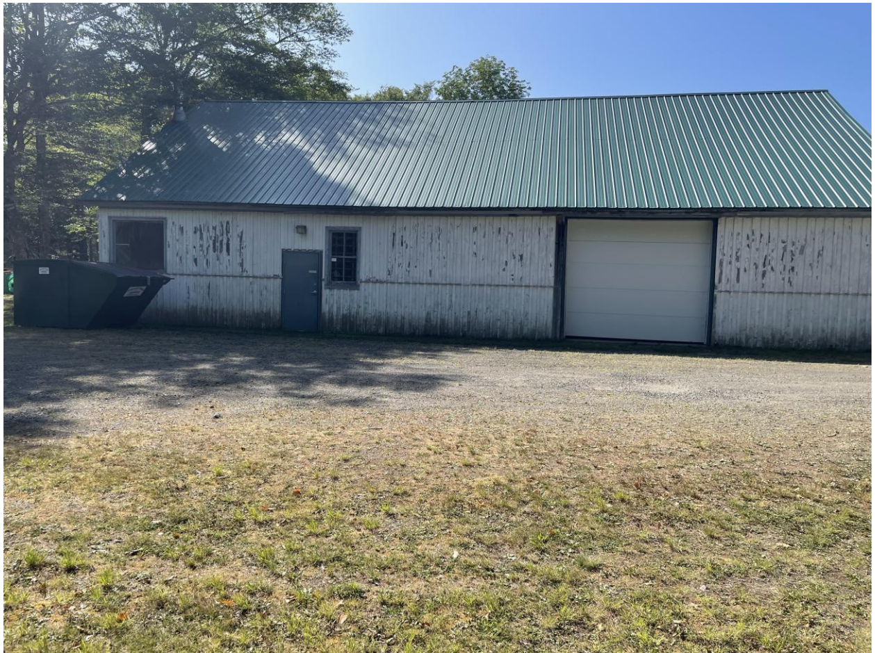
Southwest side of building